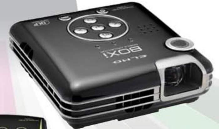
T-350 Easy-to-Use Simplified Model