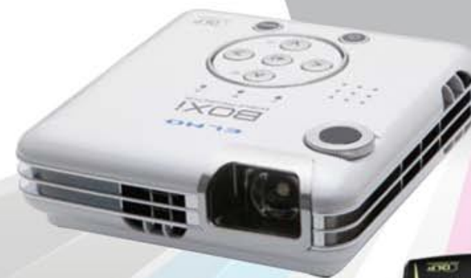
MP-350 Exceptionally Adaptable Multi-Functional Model