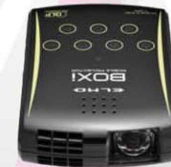
T-200 Light & Slim Model